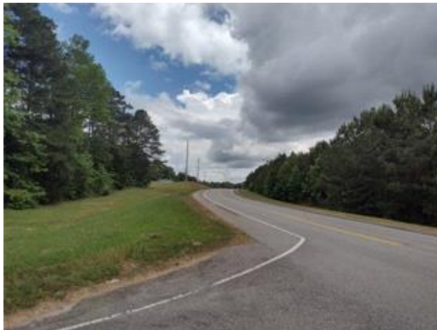
Street Frontage (Subject on Left)