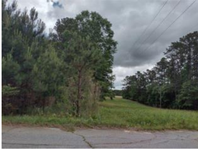
Power Lines Through Portion of Subject