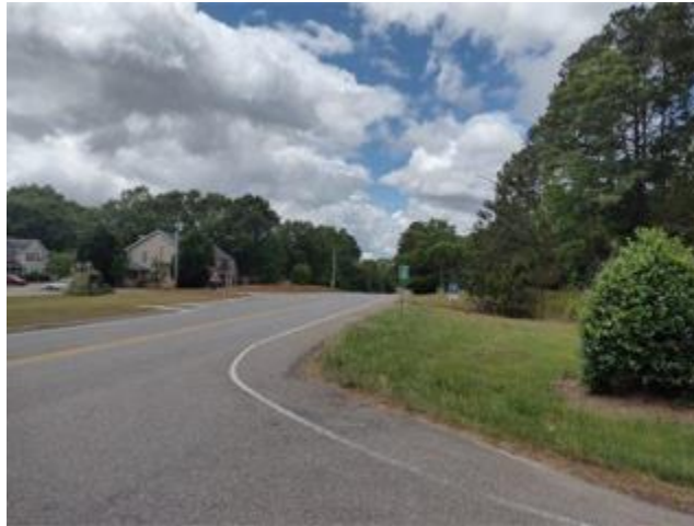
Street Frontage (Subject on Right)