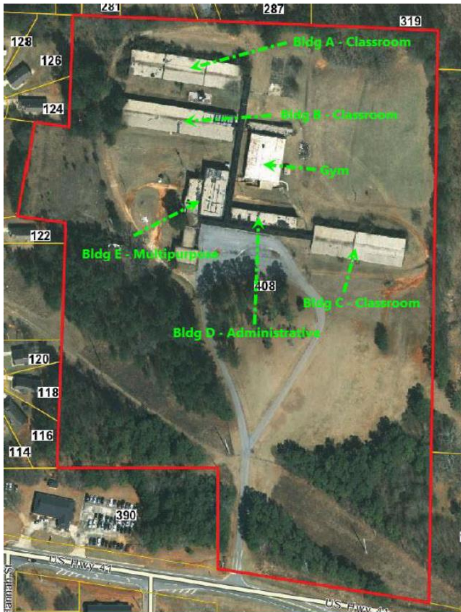
(Boundary Lines are Approximate; Building Labels are Previous Use)