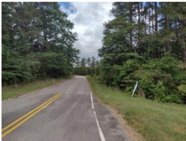
Subject Drive Entrance